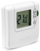
DT92 Digital Room Thermostat