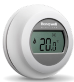
Y87 Digital Room Thermostat

Where there is a requirement to use a wireless room thermostat as a temperature sensor, both Honeywell's DT92 Digital Room Thermostat and the Y87 Single Zone Room Thermostat can be included into the evohome system.