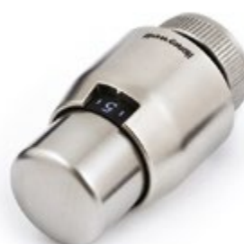
Classic Brushed Chrome Head