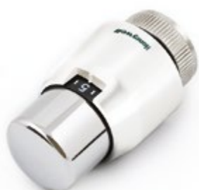
Classic White and Chrome