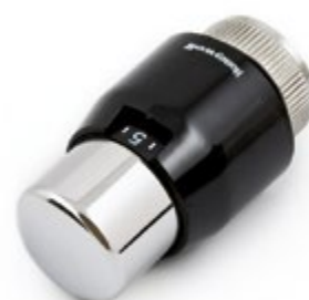
Classic black and Chrome Head