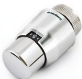
Classic Chrome Head