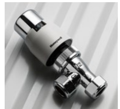
A variety of body sizes based on the same modern fluted design