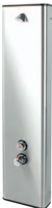
shower panel stainless steel with thermostatic temperature control, timed flow control and vandal resistant shower head SP9210CP

designed for use in commercial washrooms