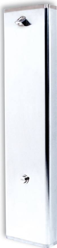
Vandal Resistant Shower Panel