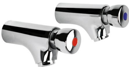
non concussive wall mounted tap (pairs) NC170CP