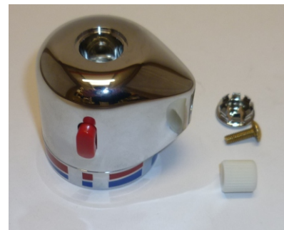
20MM.PL2.CP1 - Temperature Control Handle