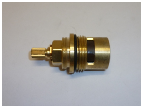
VC.03FL.CP - Flow Control Cartridge