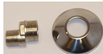
05RE31CR - Concealing Plate with Connector