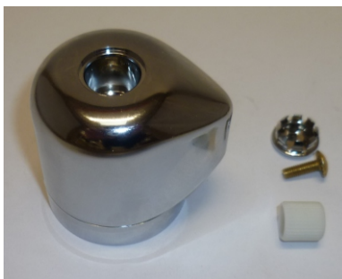
20MC.PL2.CP1 - Flow Control Handle