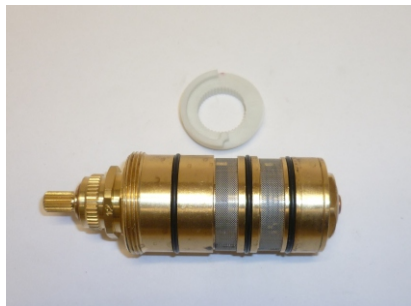
20071 - Thermostatic Cartridge