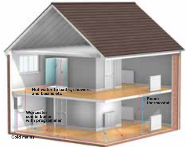
Combi boiler layout

Both a system boiler and a regular boiler work on the principle of stored hot water – but a system boiler is different in two important ways. Firstly, many of the components of the heating and hot water system are built into the boiler itself, making it quicker and easier to install. Secondly, it doesn't need a feed and expansion vessel in the loft. There are two kinds of cylinder which this type of system may have – a mains pressure hot water cylinder or a low pressure hot water cylinder. They are also compatible with solar water heating systems to bring you the added benefits of environmentally friendly hot water and reduced hot water and heating costs.