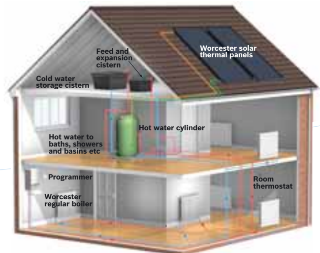
Regular boiler layout and solar water heating system