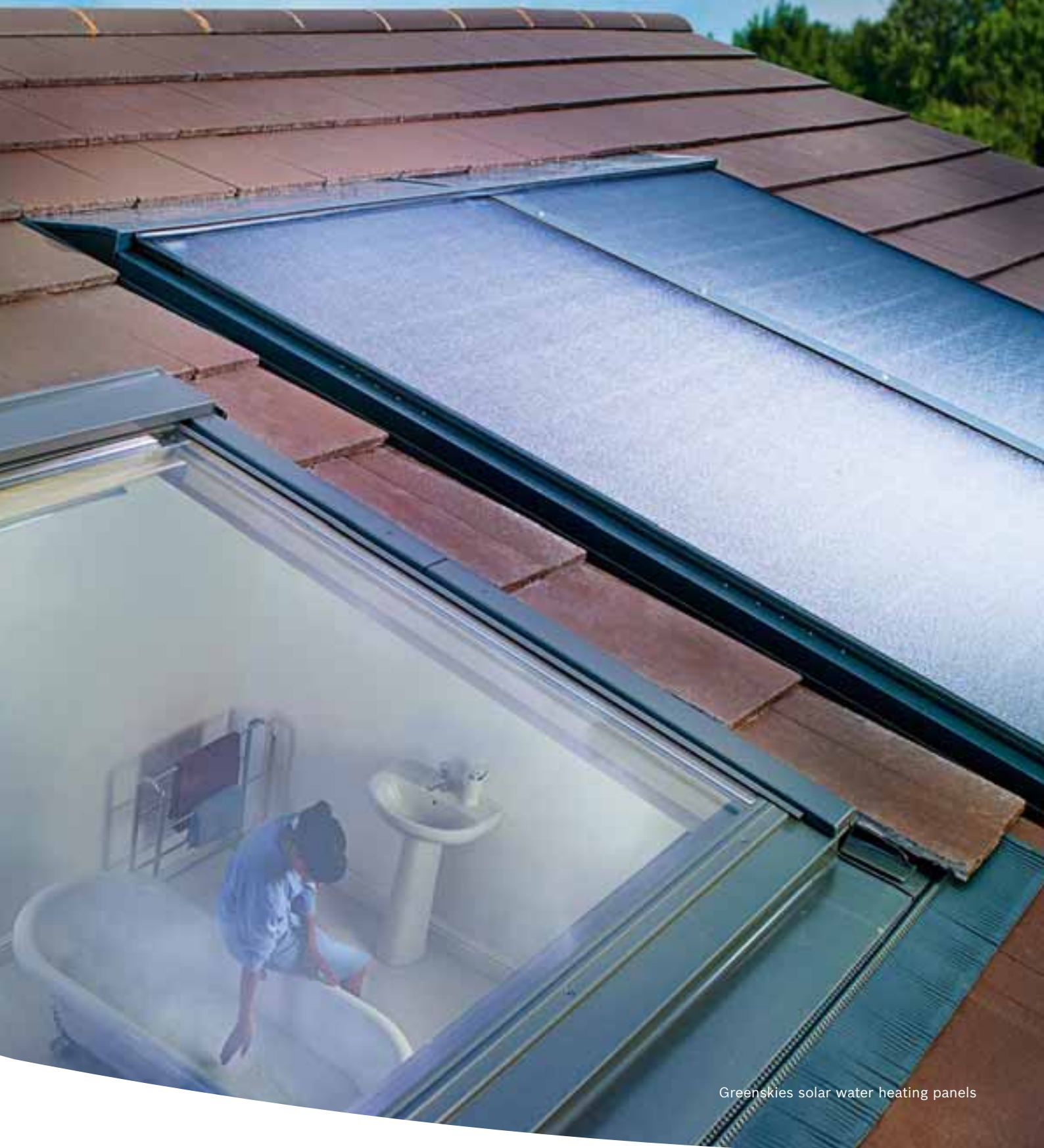
Greenskies solar water heating panels