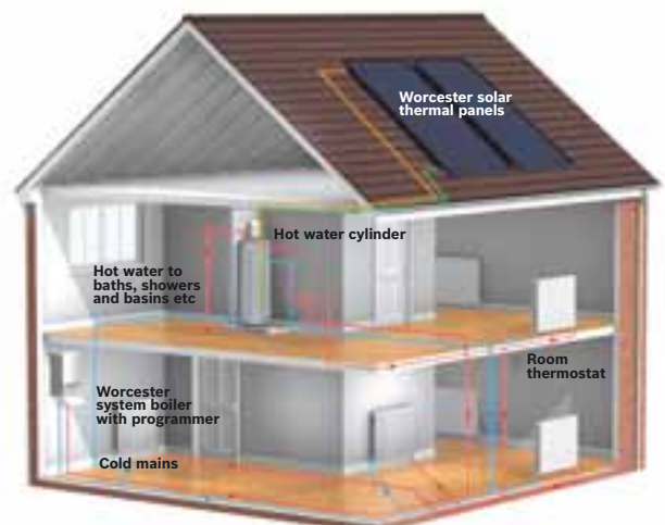
System boiler layout and solar water heating system (System boiler with unvented hot water cylinder)