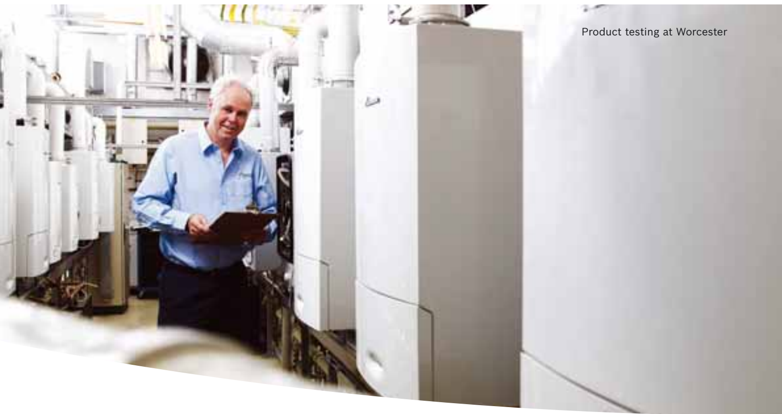
Product testing at Worcester